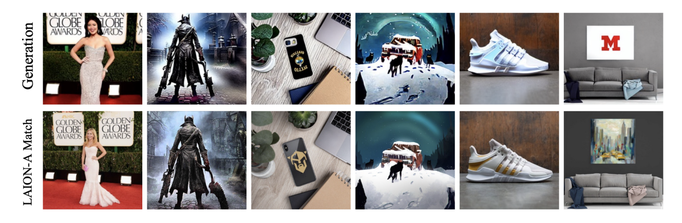
Figure 3: A comparison between training images and generated images (by Stable Diffusion). Top row : generated images. Bottom row : closest matches in the training dataset (LAION). The comparison shows that Stable Diffusion is able to replicate training data by combining foreground and background objects.