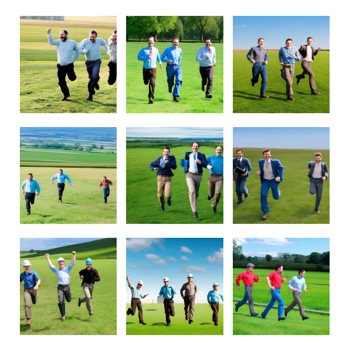
Figure 4: Images generated with the text "Three engineers running on the grassland" by Stable Diffusion v2.1. There are 28 people in the 9 images, all of them are male. Moreover, none of them belong to the neglected racial minorities. This shows a huge bias of Stable Diffusion.

new training data and update the model regularly.